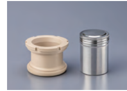
Heat-resistant Adapter For 150 ml SUS container