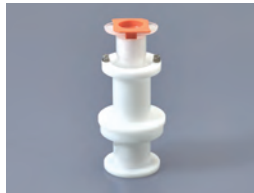
100AD-30S For 20/30 ml syringe