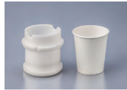
250AD-205KAMI-CUP For 205 ml paper cup