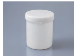
360 ml container [Type K] With keyways

* 160 ml light-resistant container is also available.