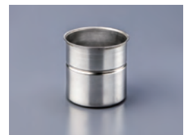
300 ml SUS 300 ml SUS container