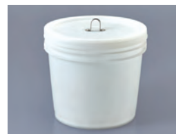
4000 ml container