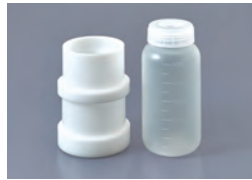
500AD-ASONE500 For BOTTLES Wide Mouth 500 ml (AS ONE)