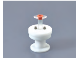
100AD-3S For 3 ml syringe