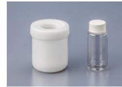
250AD-50SCR For 50 ml vial glass bottle