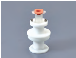
100AD-10S For 10 ml syringe