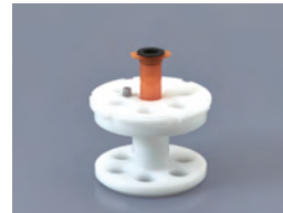
250AD-5S For 5 ml syringe