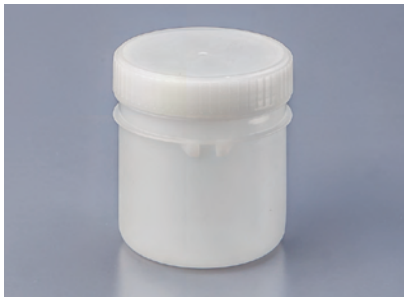
300 ml container

● Disposable cups and plastic containers.