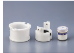
250AD-20DT For Dotite 20g