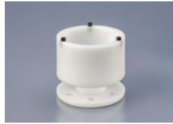
500AD-250 For 250 ml/300 ml container