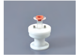
100AD-5S For 5 ml syringe