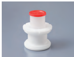
250AD-100BS For 100 ml barrel