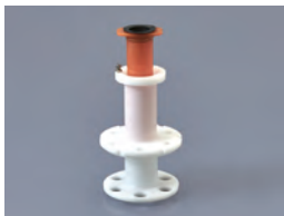
250AD-50S For 50 ml syringe