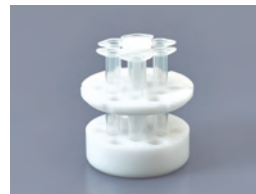
250AD-M3S×6 For Musashi syringe 3 ml×6

* All the syringes/barrels shown in the pictures above are not included.