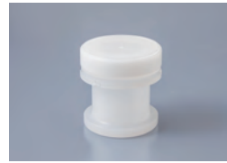
250AD-100DSP-MP For 100 ml disposable cup (with lid)