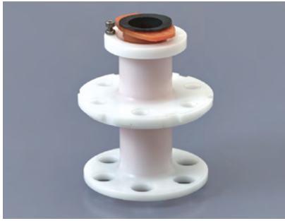
250AD-30S For 20/30 ml syringe

● We provide various adapters for syringes and barrels. Contact us for items not listed.