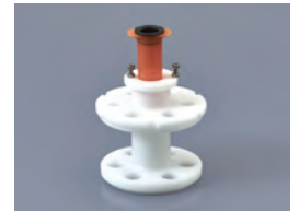
250AD-10S For 10 ml syringe