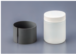
250AD-300CH For CH300 container