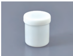
150 ml container