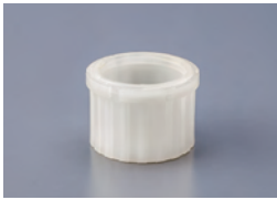
250AD-201 For 150 ml container