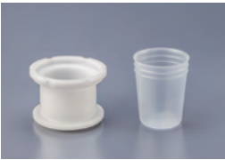
250AD-100DSP For 100 ml disposable cup