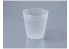
200 ml disposable cup