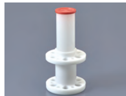
500AD-170B For 170 ml barrel