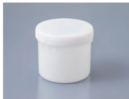
250 ml container