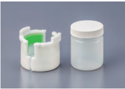
250AD-200CH For CH200 container