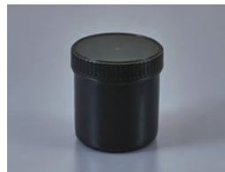
300 ml light-resistant container

* 160 ml light-resistant container is also available.