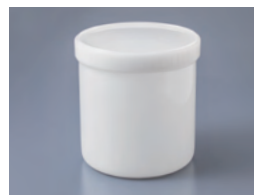
1000 ml container