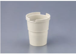
100AD-100DSP For 100 ml disposable cup