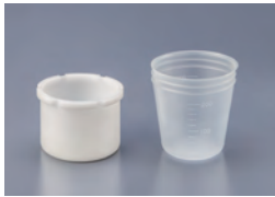
250AD-200DSP For 200 ml disposable cup