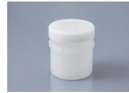
250AD-200DSP-BLOW For 200 ml disposable cup (with lid)