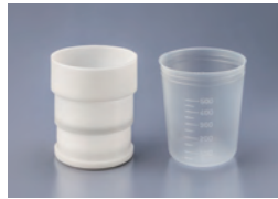
500AD-500DSP3 For 500 ml disposable cup