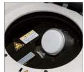
● Container holder, Balance adjustment dial