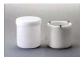
● Accessories: Containers, Adapter