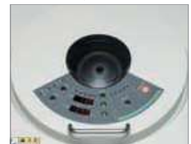
● Control panel