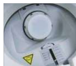
● Container holder, Balance adjustment dial