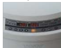
● Control panel