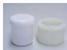
● Accessories: Container, Adapter